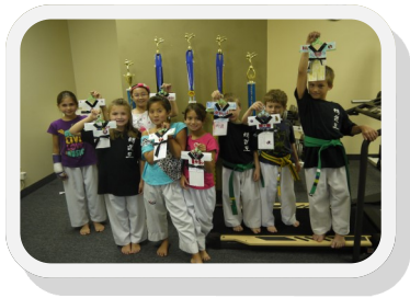
ARTS & CRAFT