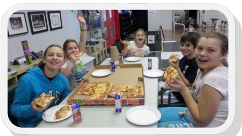
PIZZA LUNCH TIME